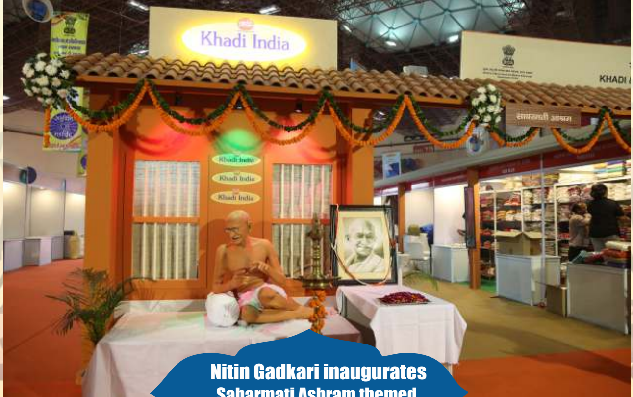
Nitin Gadkari inaugurates Sabarmati Ashram themed Khadi Pavilion at IITF