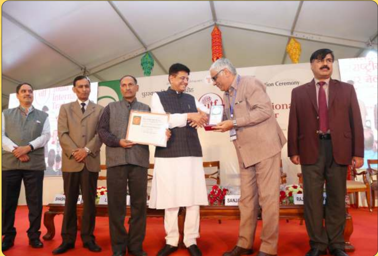
Shri Piyush Goyal Hon'ble Minister of Commerce and Industry, Govt. of India presented the shield on 28th November, 2019 at New Delhi

Village Industries plays a key role in the development of the country. Various steps, such as promotion of pottery at railway stations, ban on import of agarbatti, ban on import of National Flag, new HS Code for 11 khadi products, new Khadi stores, development of centralized Government Supply module etc., have been taken to ensure that the Indian Village Industry Products are promoted.”