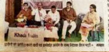
खादी निर्यात के लिए अच्छी पैकिंग और ब्रांडिंग पर व्याख्याताओं पर व्याख्यान दिया।

के अनुसार प्रशिक्षण दिया जाना चाहिए। मार्केट के अच्छे ब्रांड को फॉलो कर अपनी कमियों को भी खोजना चाहिए कि क्या कि अच्छी खादी कैसे की जाए। उन्होंने कहा कि खादी केन्द्रों को अपने उत्पाद मुम्बाई, चेन्नई, हैदराबाद इत्यादि मैट्रो सिटी तक भी पहुंचाना चाहिए। इससे खादी के कपड़े अच्छे रेट और लाभ के साथ बिकेंगे तो बुनकरों और कामगारों को भी अच्छा पैसा मिलेगा।