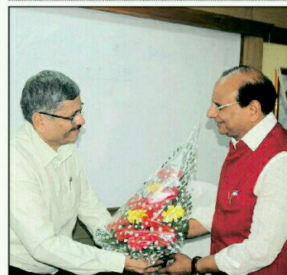
उत्पादन करने और खादी और ग्रामोद्योगी उत्पादों की बिक्री आदि क्षत्रों से संबंधी कार्य में तीव्रता लाने के लिए की गई है.

कार्यालय संवाददाता मुंबई, खादी और ग्रामोद्योग आयोग (केवीआईसी) ने अपने काम में पारदर्शिता तथा योजनाबद्ध दक्षता लाने के लिए अटोस इंडिया के माध्यम से ई-गवर्नेंस की शुरुआत की. केवीआईसी के अध्यक्ष वी.के. सक्सेना ने आयोग के केंद्रीय कार्यालय में ई-गवर्नेंस की शुरुआत की. सक्सेना के अनुसार अटोस इंडिया की भागीदारी के साथ एकीकृत वित्तीय प्रबंधन प्रणाली के कार्यान्वयन को बढ़ावा देने और डिजिटाइजेशन का उन्मयन करने की एक बड़ी पहल है. इससे पूरे भारत में केवीआईसी के एक नए युग की शुरुआत होगी.