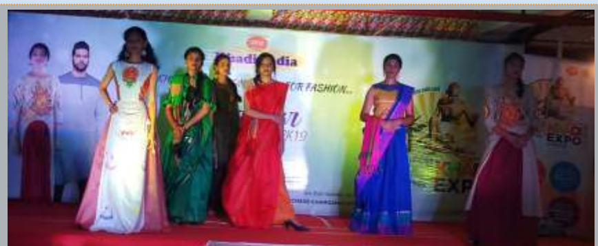
Khadi fashion show held at Khadi Expo 2K19 Kottayam Kerala

An exclusive Khadi & Village Industries products exhibition is being held at the Indoor Stadium of Sports Council in Kottayam, Kerala from 2 nd till the 14th of March. Do visit for a wide range of organic & handcrafted products.