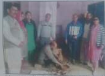
सुंदरनगर: सुंदरनगर के तुनाही में मिट्टी के बरतन बनाने की कला सीखते प्रजापति समाज के सदस्य

इस अवसर पर अखिल भारतीय प्रजापति कुंभकार महासंघ के मुख्य