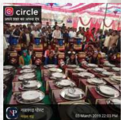
160 कुम्हारी को बांटे इलेक्ट्रॉनिक चाक