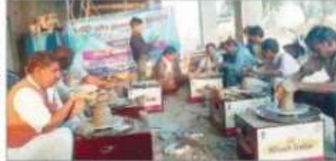
इलेक्ट्रॉनिक चाक का प्रशिक्षण लेते कुम्भकार।

रावतसर, 9 मार्च : अक्सर आप कुम्हार को डंडे से चाक घुमाकर बर्तन बनाते देखते होंगे, लेकिन हाथ से चलने वाला यह