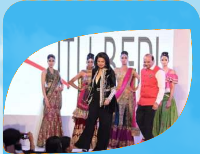
Khadi Batik Fashion Show at KBRI, New Delhi.