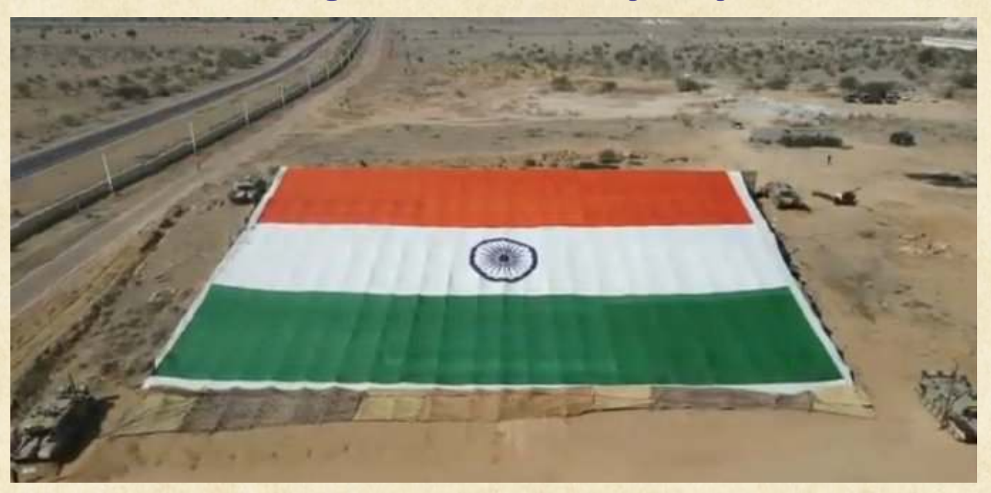
The Monumental National Flag, which is the world's largest national flag made of Khadi fabric, put to a grand public display along the India – Pakistan Border in Jaisalmer to celebrate "Army Day" on 15th January, 2022.

The Monumental National Flag displayed at Longewala which was the center stage of the historic battle between India and Pakistan in 1971.