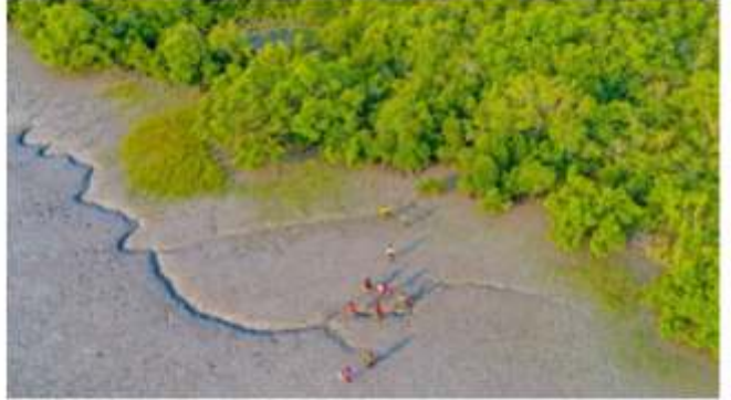
আদি শিক্সের উল্লেখ্য অভিনয়ের অভিন্য সংস্থান সুশারবাদে

সুন্দরবনের খাদি এবং গ্রামীণ শিল্প নিয়ে বছদিন ভাবনা চিন্তা করে পর এবার আসলেই তার মাধ্যমে অর্থ রোজগারের পথ খুঁজে পেয়েছেন মহিলারা। বাঘের হানায় প্রাণ হারিয়েছেন এলাকার বহু মানুষ বিশেষ করে তাদের স্ত্রীদের আর্থিক সুবিধা দিতেই সরকারের পক্ষ থেকে এই কর্মকাগুকে নয়া রূপ দেওয়া হয়েছে।