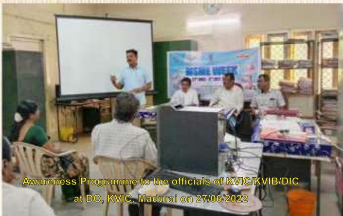
Awareness Programme to the officials of KVIC/KVIB/DIC at DO, KVIC, Madurai on 27/06/2022