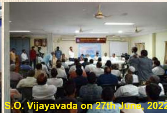
S.O. Vijayavada on 27th June, 2022