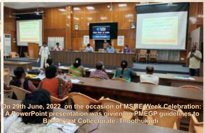
On 29th June, 2022 on the occasion of MSME Week Celebration: A PowerPoint presentation was given on PMEGP guidelines to Bankers at Collectorate, Thoothukudi .

Divisional Office, Khadi and VI Commission, Hubli has celebrated MSME Week by conducting awareness programme at DO, KVIC Hubli and Deshpande Foundation, Hubli on 29th June'22 and 1st July'22 respectively with a purpose of raising public awareness about the contribution of MSMEs to the socio-economic development of the country and to groom the budding entrepreneurs so as to utilise the skill of future work force for the nation building.