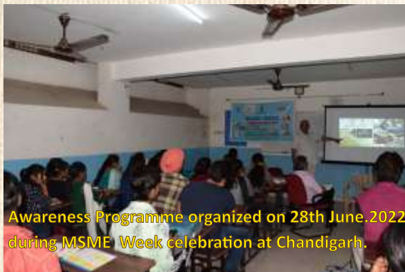
Awareness Programme organized on 28th June, 2022 during MSME Week celebration at Chandigarh.