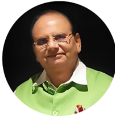
Vinai Kumar Saxena Chairman Khadi and Village Industries Commission

In the past two centuries, millions have been killed by flu, plague and similar pandemics and they all coincided with the post-Industrialisation era that also led to massive urbanisation. Textile industry and textile market are prime examples of industrialisation and urbanisation.