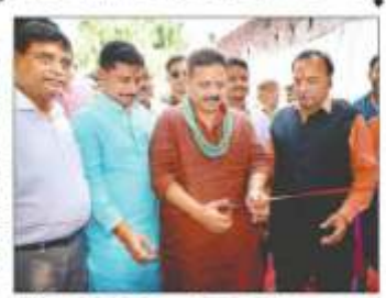
तेतिकावन में 32 विकरीय राज्य सर्वीय खारी प्रशानि का उद्यादन करते रहोप हार्च पंजीवन के महत्त्र प्रभार राजानंत्री त्वींह जावस्थान। अगर राजन

march it was be sent ut क्षेत्रेट के असार खाउँ का स्थाप ख समया देश खरिया १६० frem mores few war निकातीरे। बारपेट बार्टीसल के drambs fraggers fair it was fin