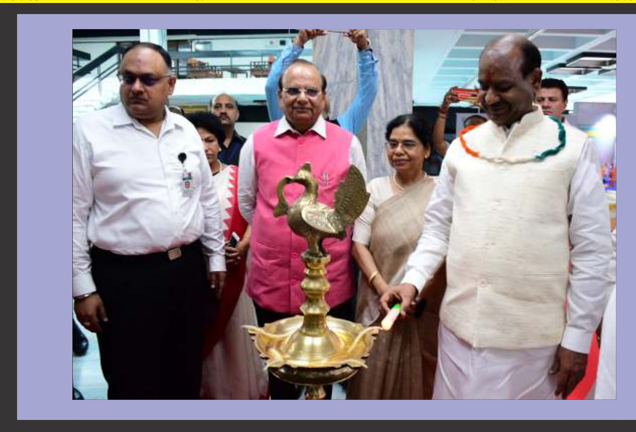
Lok Sabha Speaker inaugurates KVI exhibition in Parliament House