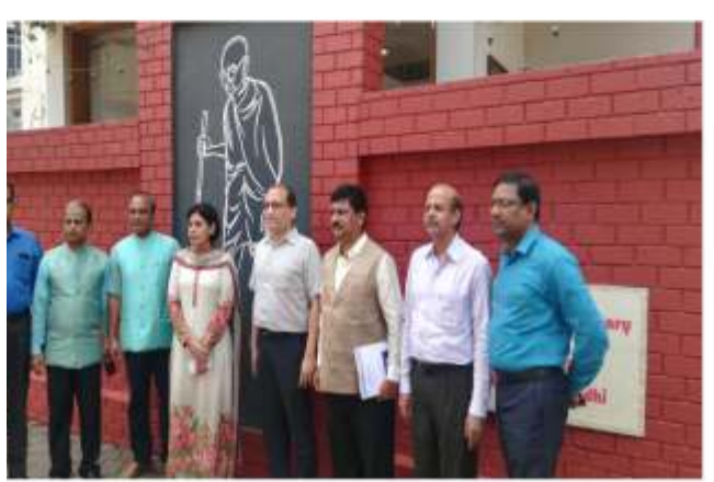
ENTER, IRLA, VILEPARLE, MUMBAI