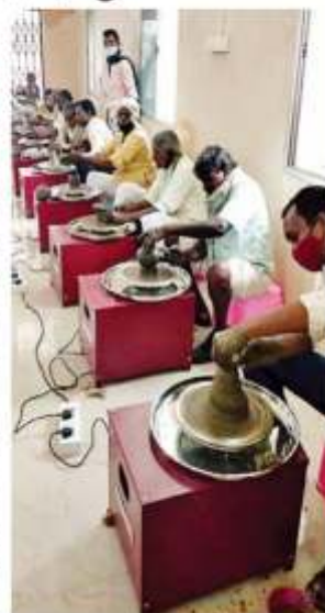
का कार्यक्रम आयोजित किया गया। दोनों प्रशिक्षण कार्यक्रम में प्रत्येकी 40 से अधिक कुंभार समाज के युवाक-युवती व महिलाएं शामिल हुए थे।

नागपुर। मिट्टी की आकर्षक डिजाइन की वस्तुओं की भारी मांग है। मिट्टी की संपपन्नता वस्तु तैयार करने समय उसका मूल्यवर्धन करते हुए मिट्टी की उत्तम डिजाइन की वस्तु तैयार कर कुंभार समाज अपनी आय बढ़ाए और विकास करें। ऐसा प्रतिष्ठान केंद्रीय भूदान, परिवहन व एमएसएमई मंत्री गजेंद्र सिंह ठाकुर ने किया। एमएसएमई व खादी ग्रामोद्योग आयोग की ओर से कुंभार समाज के युवा व महिलाओं को प्रशिक्षण व स्वचालित पहिना वितरण कार्यक्रम में गडकरी मार्गदर्शन कर रहे थे। एमएसएमई व खादी ग्रामोद्योग आयोग की कुंभार समाज सरतीकरण योजना के अंतर्गत पहिना व पत्रक वितरण किया जा रहा है। खादी ग्रामोद्योग आयोग और भारत बायो लोकेसोव प्रौद्योगिकी की ओर से कुंभार प्रशिक्षण का कार्यक्रम आयोजित किया गया। केंद्रीय मंत्री गडकरी की पहल और निर्देशानुसार इस प्रशिक्षण कार्य में 40 कुंभारों को 40 पहिने और 10 कुंभारों के एक गट को। पत्रक 10 प्रशिक्षण राशि के अंतर्गत के साथ तथा शेष राशि अनुदान स्वरूप में खादी ग्रामोद्योग व एमएसएमई मंत्रालय की ओर से दी जानेवाली है। उद्देश्यपूर्ण है कि गांधी जयंती व लगत बहादुर शाही जयंती के उपलक्ष्य में साबनेर तहसील के छापा में आयोजित प्रशिक्षण कार्यक्रम का सैंडिबो कॉन्फ्रेंस के माध्यम से गडकरी के हाथों उद्घाटन किया गया। 24 अक्टूबर को कुड़ी तहसील के चाणपट्टी में कुंभार समाज प्रशिक्षण कार्यक्रम आयोजित किया गया। छापा व साबनेर में भी प्रशिक्षण