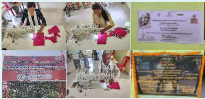
Gram Swawlambi Vidyalaya, RMG, Ayodhya.