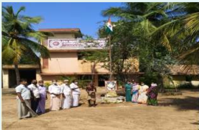
Swachh Bharat Mission activities carried out by Khadi Institutions namely Cuddalore Sarvodya Sangh.