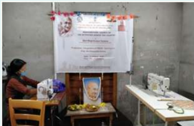
PMEGP Unit : Garchuk, Guwahati.