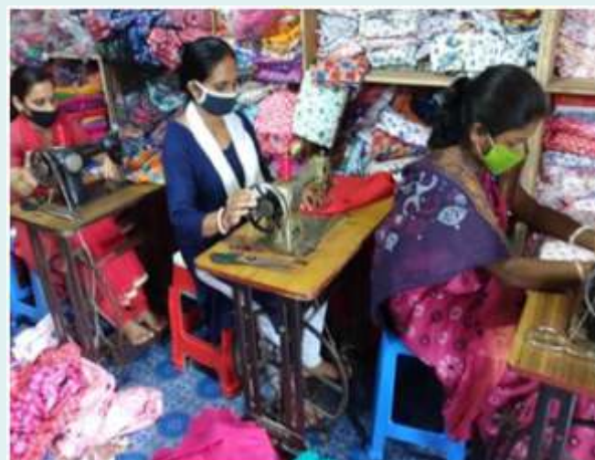
PMEGP Unit: Ranigaon, West Tripura, Agartala.