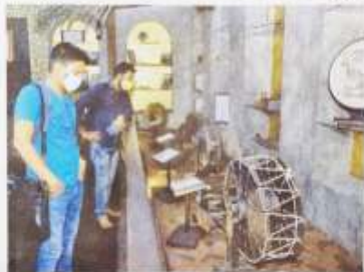
युवा जयंती के अवसर पर कमीट वन के चरखा संग्रहालय में गांधी के चरखे विभिन्न प्रकार के चरखों का अनावरण किया गया।

जयपुर मंडळ, नई दिल्ली कमीत कमी मिनी चरखा बांधण्याचा उद्योग करणे ही युवाओं की जयंती पर प्रेरणा बन रहा है। लॉन्चिंग के बाद पहले दिन पाँच घण्टे तक बापू का चरखा चल रहा है। लोगों ने कहा कि बापू जल्दी से लोगों के लिए प्रेरणा बनने दें और आज भी है। आज उनकी चरखा युवाओं को सलाह पर चलने को प्रेरणा दे रहा है। लोगों ने