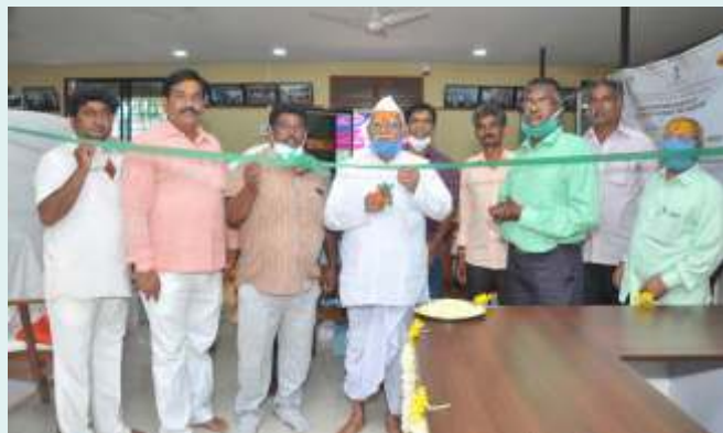
Khadi Bhandar inaugurated at Kanakadaskur