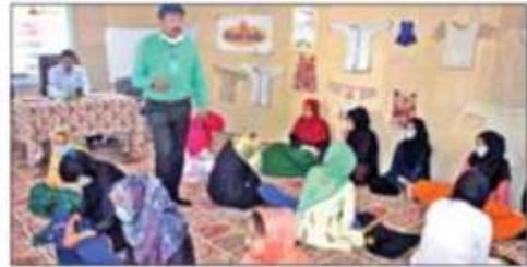
KVIC official interacting with trainees.