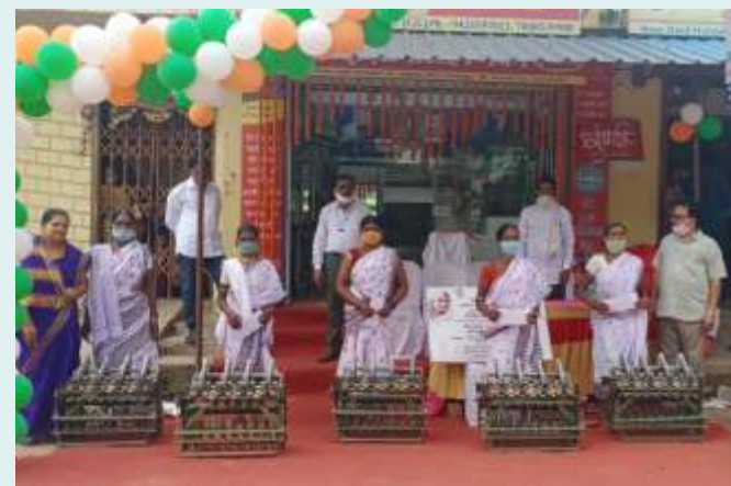
NMC distributed at Bastar Jila Khadi Gramodyog Sangh, Jagdalpur, Chhattisgarh.