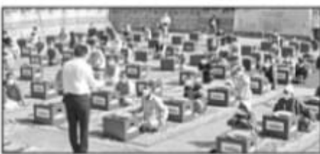
KVIC official interacting with potters.

■ STATE TIMES NEWS BARAMULLA: On the occasion of Gandhi Jayanti, State Office, Khadi & Village Industries Commission (KVIC), Jammu, on Friday distributed 100 electric potter wheels to potters at Palhalan, Baramulla under Kumbhar Sashaktikaran Yojana.