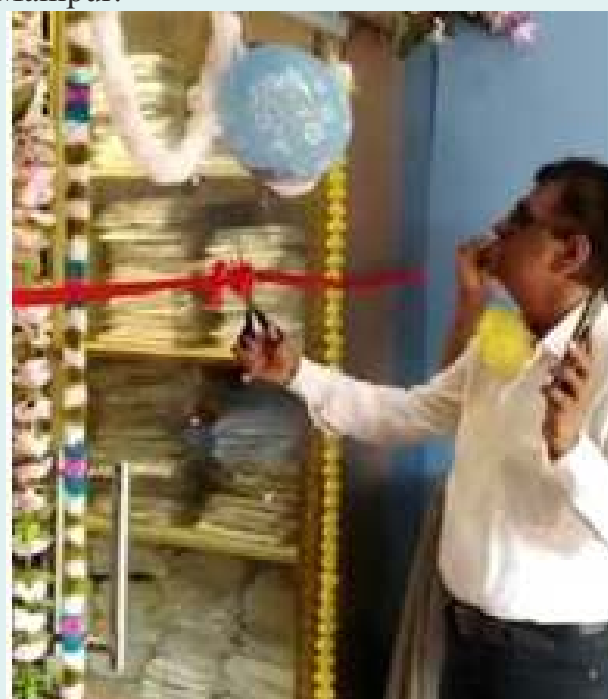
Sales Outlet :Imphal, West Manipur.