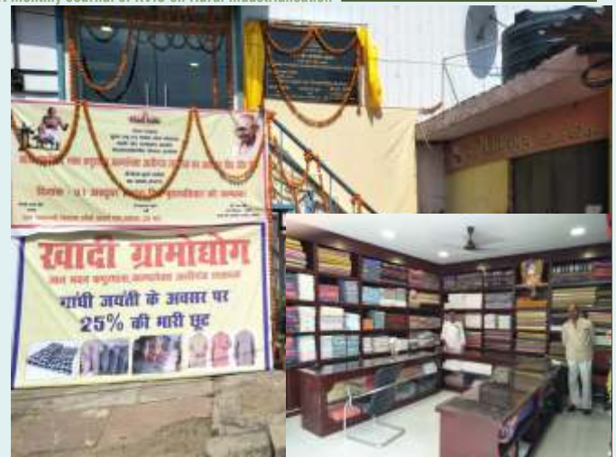
Inaugurated Khadi sale at Gram Swawlambi Vidyalay, KGB, Lucknow.