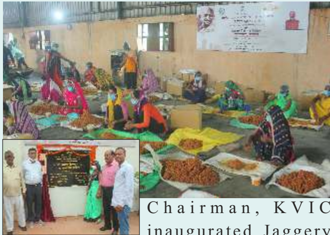
Chairman, KVIC inaugurated Jaggery making unit at Parjanpur, Mangalpur, Varanasi on 1st October, 2020.

Contd. from pg. no 12 .....Glimpse of events organised while celebrating 150 years of Mahatma Gandhi