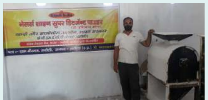
Detergent powder unit inaugurated at Aayodhya, U.P.