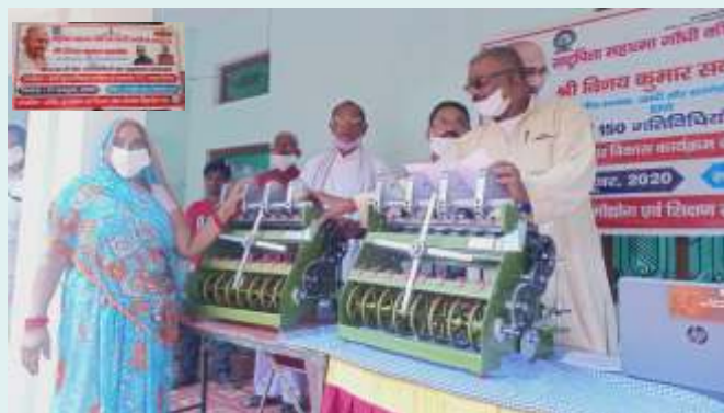
New Model Charkha distribution programme inaugurates at Mau, Madhya Pradesh.