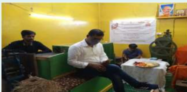
Inauguration of PMEGP Unit : Bara Bazar, Nagaon.