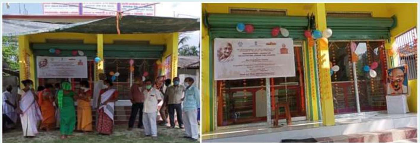
Sales Emporium : Dhamdhama, Nalbari