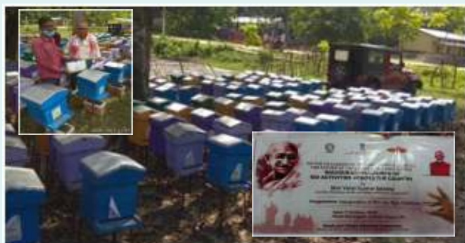
Bee Boxes and tool kits : Rupahi Beel, Marigaon