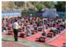
The distribution ceremony through video conferencing. While distributing Electric Potter Wheels he lauded the self employment scheme of KVIC and urged to avail the benefits of these schemes. He further stated that Electric Potter Wheel will provide them sustainable livelihood and will improve their socio-economic conditions. These potter thanked the Hon'ble Chairman, KVIC saying that this will enable them to earn better livelihood and become 'Asta Nishkar' (not salaried employees).