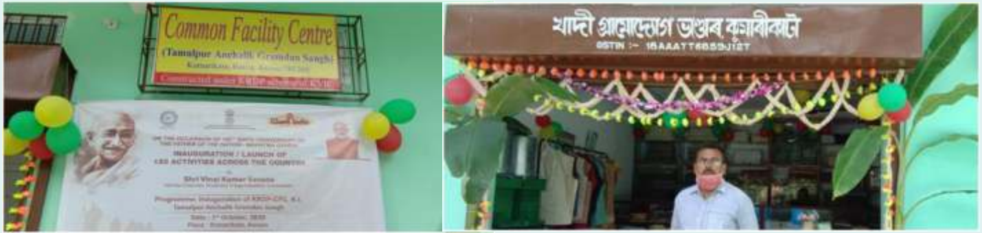
KRDP Unit : Tamulpur, Baksa