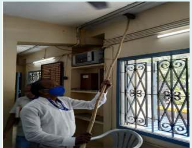
State Office , KVIC, Chennai – “Shramdaan” activity conducted on 02nd October, 2020.