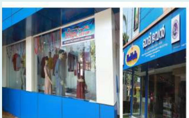
Chairman, KVIC inaugurated "Design Clinic" of Payyannur Firkha Gramodyog Khadi Sangh, Kerala on 1st October, 2020