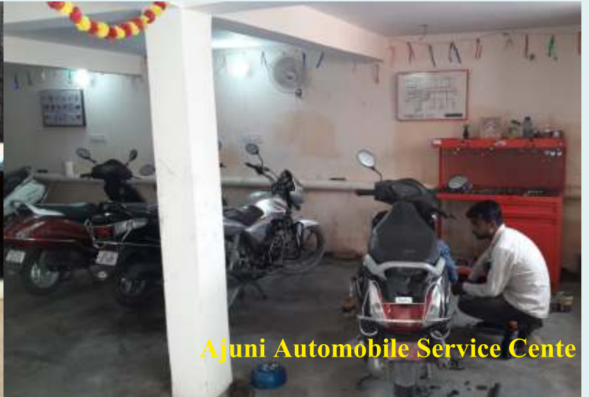
Ajuni Automobile Service Center