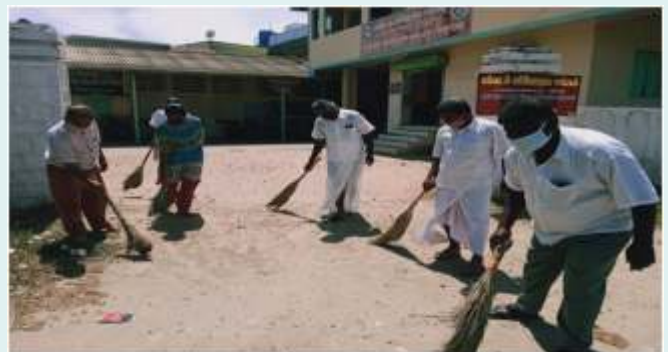
Swachhata activities conducted by Palladam Sarvodya Sangh, a Khadi Institution.