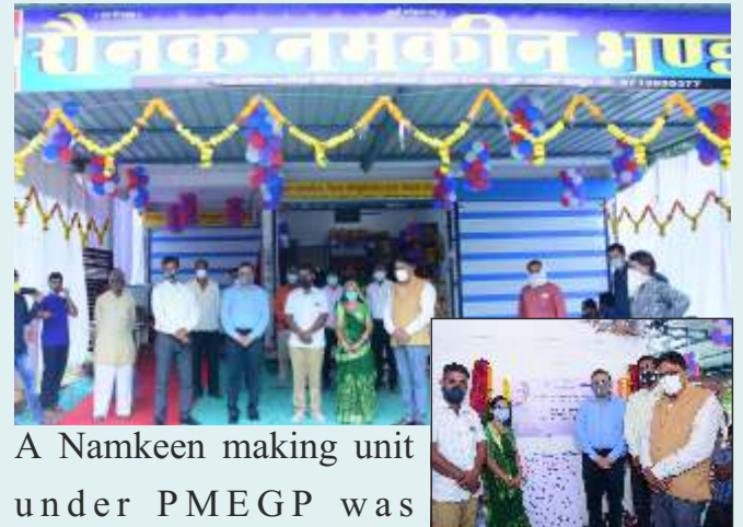
A Namkeen making unit under PMEGP was inaugurated by Chairman, KVIC on 1st October, 2020 at Devas, Madhya Pradesh.