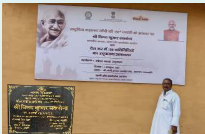
Shri Gandhi Ashram Utpatti Kendra, Varanasi