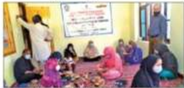
KVIC officials inspecting craft works of trainees