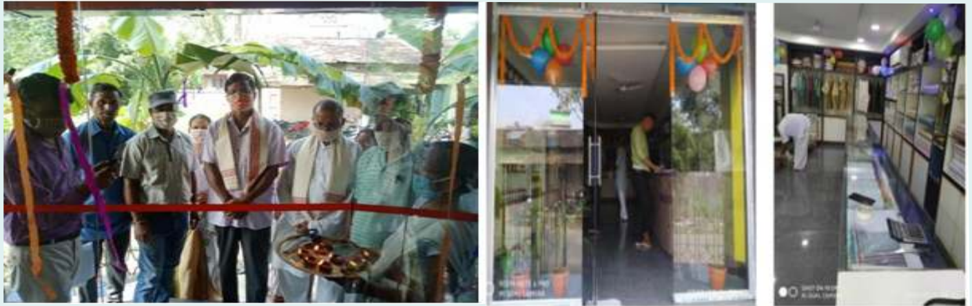
Emporium : Bijohnagar, Kamrup (R)