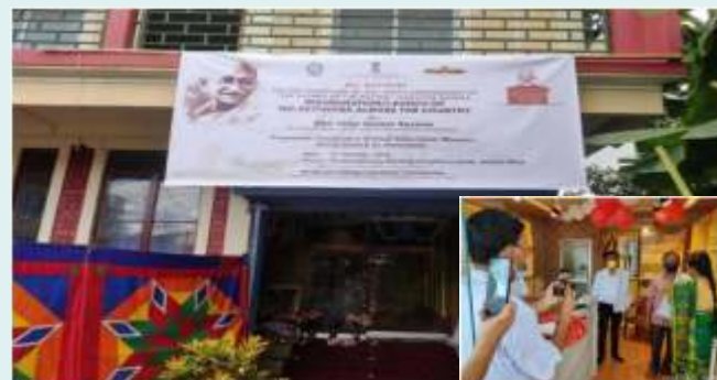
Inauguration of Sales Outlet : Imphal West, Manipur.