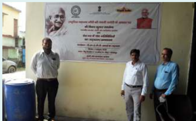
Ritu Industries, Gorakhpur , UP.