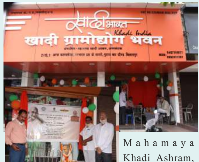
Mahmaya Khadi Ashram, Bilaspur - Bhavan inauguration by Shri Vinai Kumar Saxena, Chairman Khadi and Village Industries Commission.