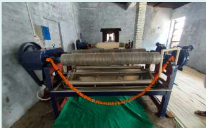
Inaugurated Gram Swawlambi Vidyalay, CFC, Ayodhya.