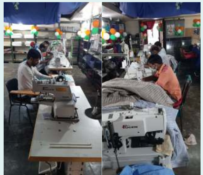
Tarun Gram Vikas Samiti, RMG, Dev Nagar.