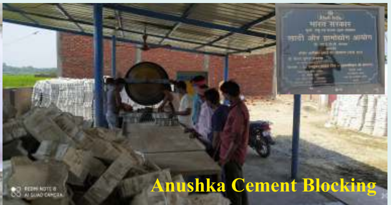
Anushka Cement Blocking