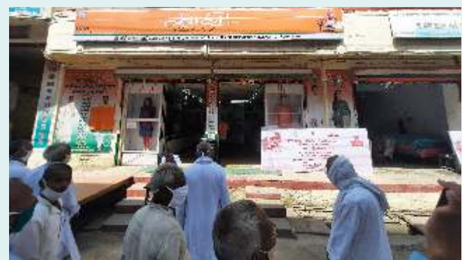
Kshetriya Shri Gandhi Ashram, Ambedkar Nagar, UP.