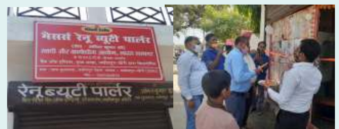
Inauguration of beauty parlour at Lakhimpur Kheri in Uttar Pradesh.