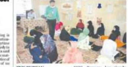
Baramulla and Village Checkpost, Tehsil: Doorn of District Anantnag respectively.

PAMPORE: On the auspicious occasion of the 150th Birth Anniversary of Mahatma Gandhi and to commemorate the contribution of the Mahatma in shaping today's India, Honourable Chairman Khadi and Village Industries Commission on 01.10.2020 has launched 150 activities across the country. As per details, Khadi and Village Industries Commission, Ministry of MSME, Govt of India has started a campaign to provide employment to youth, has started a campaign to empower them through training in various trades. In this connection, Production Cum Training Centre (PMTC),