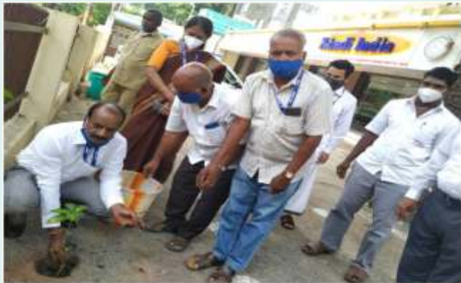
State Office ,KVIC, Chennai - planted tree in front of office building on 02nd October, 2020.