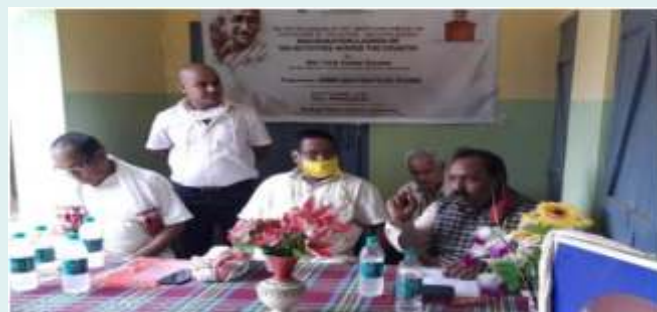
Training of Potter Wheel : Phulbari, West Garo Hills, Meghalaya.