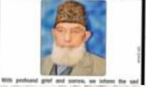
With posthumous grief and sorrow, we inform the sad demise of...