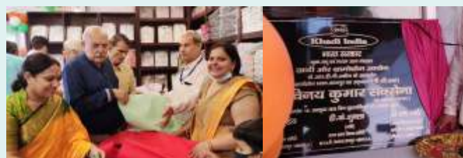
Tarun Gram Vikas Samiti, KGB, Barra.