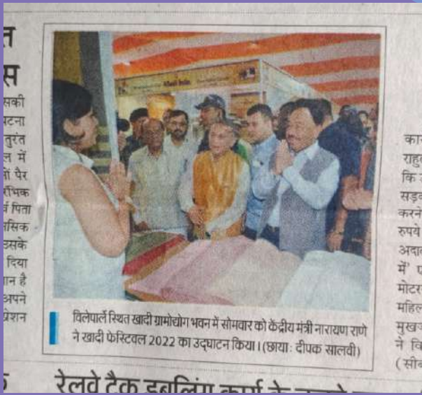
विलेपार्लैत स्थित खादी ग्रामोद्योग भवन में सोमवार को केंद्रीय मंत्री नारायण राणे ने खादी फेस्टिवल 2022 का उद्घाटन किया।