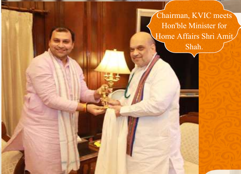
Chairman, KVIC meets Hon'ble Minister for Home Affairs Shri Amit Shah.