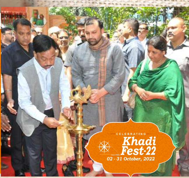
CELEBRATING Khadi Fest-22 02 - 31 October, 2022