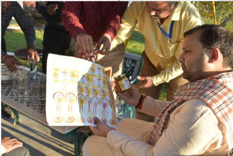
Chairman, KVIC Had one To one talk with the artisans of “Sirmaur” and Launched Sirmaur Honey