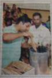
Khadi & Village Industries Commission had sponsored the training programme for 25 participants for...

Bee-keeping training camp by ICFAI ■ NRI Report Kannur, July 2: The ICFAI University Tirupur has conducted an on-site training camp on bee-keeping, which is rapidly coming up as an alternate source of livelihood among the rural people. A five-day training programme on bee-keeping conducted at Kannur College of ICFAI University, Tirupur under the wings of Khadi & Village Industries Commission. The KVIC is helping the working class to a great extent by providing skill training. Approximately 20 trainees participated in the training programme from Kannur, Pudukottai, Marathalli, Bharatipattanam, Lumbudalur and Rayachoti. Most of the participants are women. On the inaugural day, KVIC Minister Tirupur demonstrated usage of Bee-keeping kit and method of preparing honey.