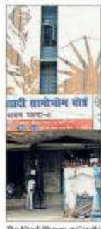
The Khadi Uniforms at Ghatika, Patna in Patna, Bihar