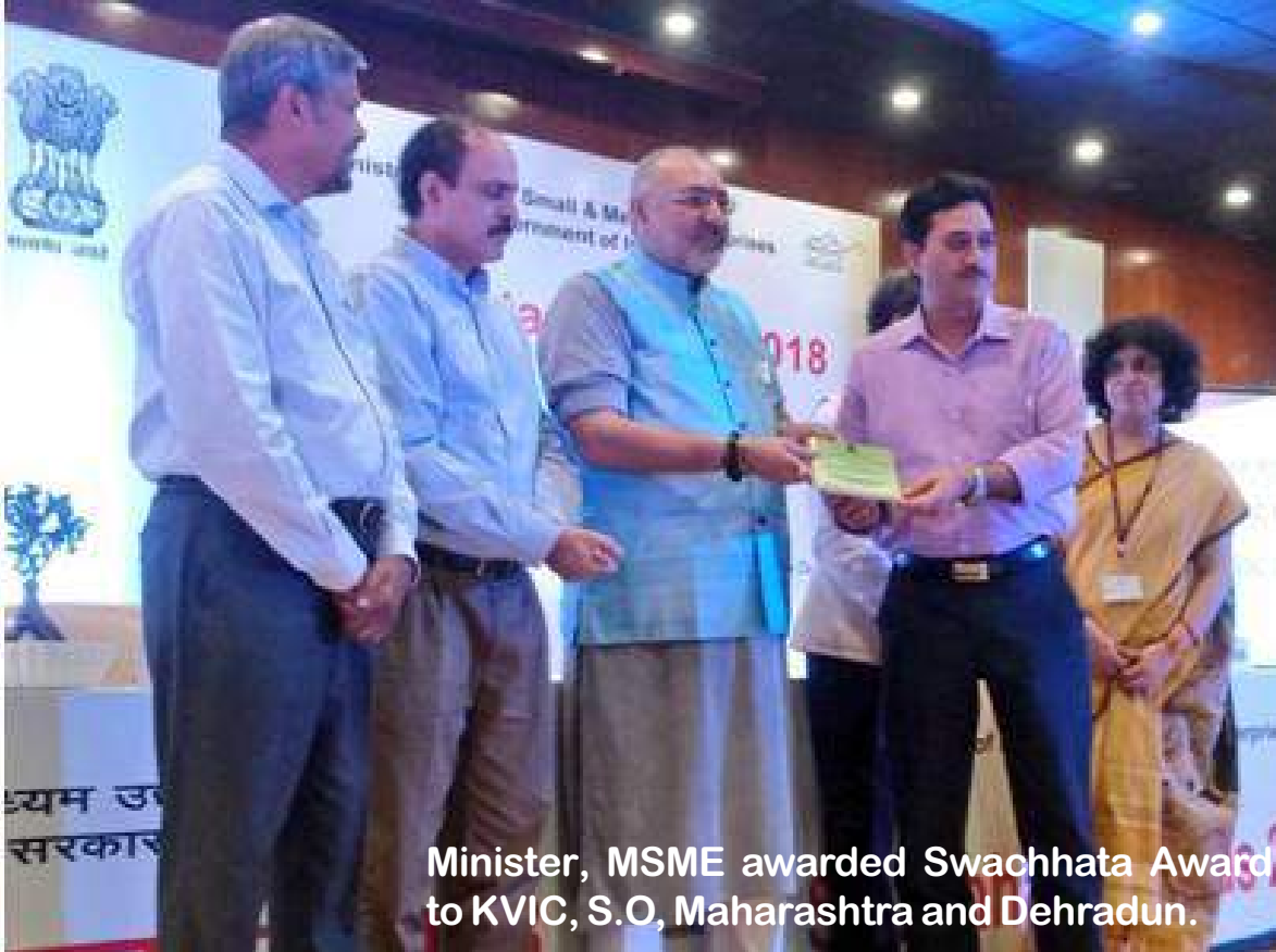
Minister, MSME awarded Swachhata Award to KVIC, S.O, Maharashtra and Dehradun.