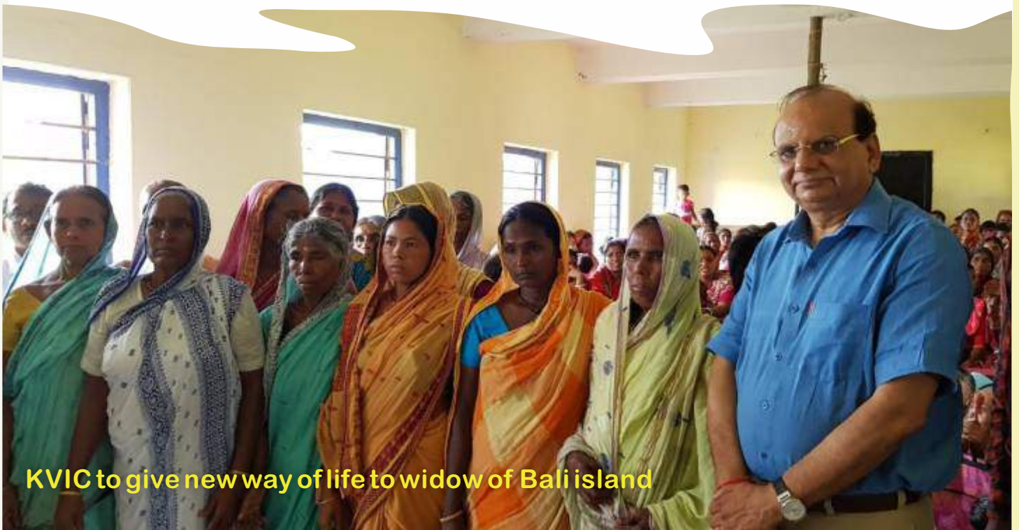
KVIC to give new way of life to widow of Bali island