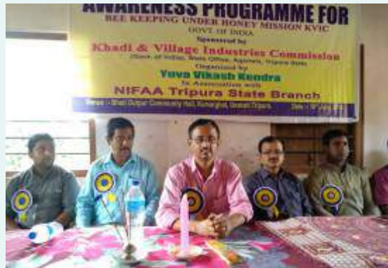
and training in tripura state during 2018-19.