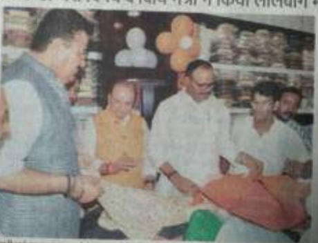
खादी मार्ट का उद्घाटन करते हुए विनय व विधि मंत्री ने कहा कि खादी और ग्रामोद्योग आयोग के अध्यक्ष विनय व विधि मंत्री ने किया लालबाग में खादी मार्ट का उद्घाटन