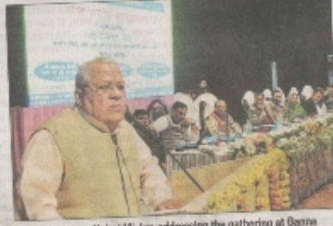
Union Minister Kalraj Mishra addressing the gathering at Centre Sanshodhan in Lucknow on Wednesday.

LUCKNOW: The union minister of micro, small and medium enterprises says as per its way to set up 25 livelihood incubation centres in Uttar Pradesh to provide pre-natal training to rural and urban youths. These centres would come up on the campus of engineering colleges governed by the All India Council for Technical Education and state government-run degree colleges.