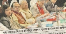
केंद्रीय एमएसएमई मंत्री कलराज मिश्र (दोसरे से दाएं) के साथ एमएसएमई मंत्रालय के अधिकारियों का एक बैठक।

लखनऊ: एमएसएमई मंत्रालय के एक उद्योग राज्य के संकल्प को अंजना देने के लिए एक बैठक का आयोजन किया गया। बैठक में केंद्रीय एमएसएमई मंत्री कलराज मिश्र और एमएसएमई मंत्रालय के अधिकारियों का शामिल होना शामिल था।