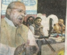
केंद्रीय एमएसएमई मंत्री कलराज मिश्र (दोसरे से दाएं) के साथ एमएसएमई मंत्रालय के अधिकारियों का एक बैठक।

प्रदेश में खर्च नहीं हो पा रही है केंद्र से मिली रकम