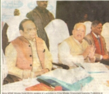
Union Minister Kalraj Mishra speaking at a meeting on Prime Minister Employment Generation Programme at Centre Sanshodhan in Lucknow on Wednesday.