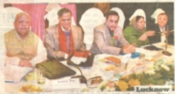
केंद्रीय एमएसएमई मंत्री कलराज मिश्र (दोसरे से दाएं) के साथ एमएसएमई मंत्रालय के अधिकारियों का एक बैठक।

लखनऊ: केंद्रीय एमएसएमई मंत्री कलराज मिश्र ने आज लखनऊ में उद्योग राज्य के संकल्प को अंजना देने के लिए एक बैठक का आयोजन किया। मिश्र ने कहा कि 'मेक इन इंडिया' के संकल्प को अंजना देने के लिए 'मेक इन यूपी' का समर्थन और सहयोग आवश्यक है। उद्योग राज्य के संकल्प को अंजना देने के लिए एक बैठक का आयोजन किया गया। बैठक में केंद्रीय एमएसएमई मंत्री कलराज मिश्र और एमएसएमई मंत्रालय के अधिकारियों का शामिल होना शामिल था। मिश्र ने कहा कि उद्योग राज्य के संकल्प को अंजना देने के लिए 'मेक इन यूपी' का समर्थन और सहयोग आवश्यक है।