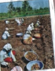
PM wants 50 per cent of farmers to join Pradhan Mantri Crop Insurance Scheme

"I need maximum help from people about spreading awareness regarding the Pradhan Mantri Crop Insurance Scheme which was launched earlier this month... a lot is being said in the name of farmers. I don't want to get involved in that debate," said Modi.