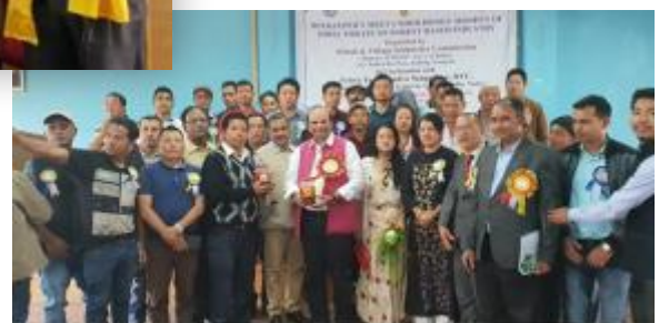
Chairman, KVIC met Beekeeper's under Honey Mission at a remote village Sumbuk in Sikkim on 29th April, 2018.