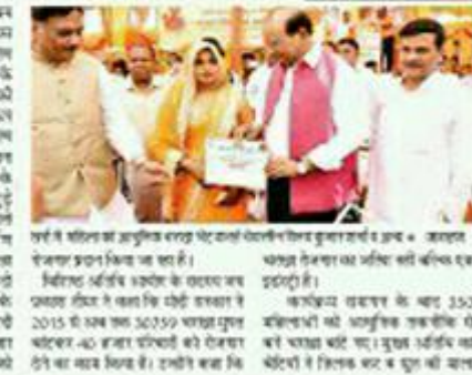
छर्ना में सर्वोदय खादी आश्रम पर समारोह में 350 महिलाओं को बांटे गए चरखा