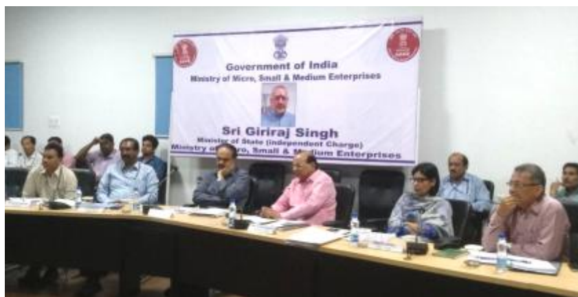
Meeting with representative of the best performing KVIC institutions at MSME DI Extension centre complex bal sahyog, Connaught place, New Delhi on 24th April 2018.