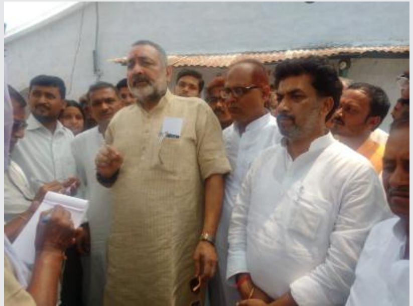
MoS, MSME Shri Giriraj Singh visited Samastipur Anumandaliya Khadi Gramodyog Samiti funded by Khadi and Village Industries Commission on 30th May, 2018.

book will help the State and ministry in days to come and every state must have Data Bank Book on MSME for reference.