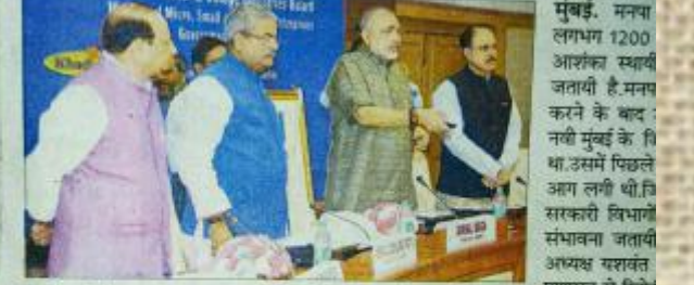
कार्यालय संवाद मुर, इली में आयोजित हुआ 15 दिवसीय खादी व ग्रामोद्योग महोत्सव