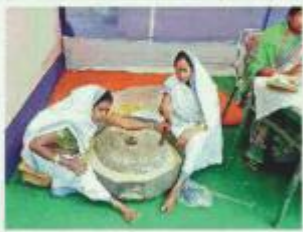
खादी के माध्यम से ग्रामीण भारत का विकास...