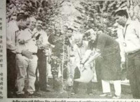
खादी के माध्यम से ग्रामीण भारत का विकास...