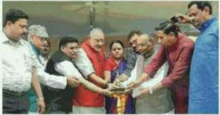
खादी के माध्यम से ग्रामीण भारत का विकास...