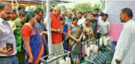
केंद्रीय मंत्री गिरिराज ने खादी प्रामोद्योग मेले का शुभारंभ किया।

खादी का शुभारंभ केंद्रीय मंत्री गिरिराज ने किया। उन्होंने कहा कि खादी को बढ़ावा देने के लिए हमें खादी की तस्करी पर जोर देना होगा। उन्होंने कहा कि खादी को बढ़ावा देने के लिए हमें खादी की तस्करी पर जोर देना होगा।