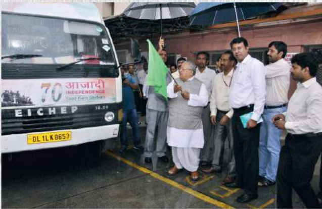
Shri Kalraj Mishra, Minister, MSME flags off the Khadi Sale van on 15th August at New Delhi.