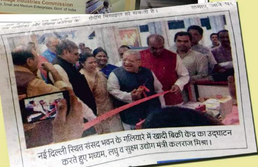
नई दिल्ली स्थित संसद भवन के गलियारे में खादी बिक्री केंद्र का उद्घाटन करते हुए मध्यम, लघु व सुक्ष्म उद्योग मंत्री कलराज मिश्रा।