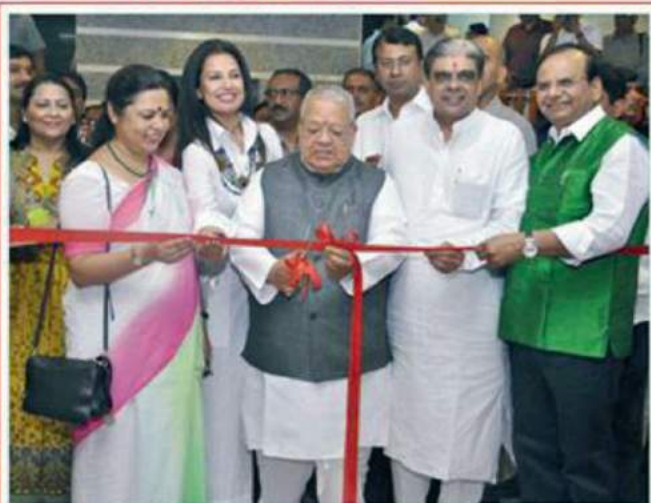
نیو دہلی: کھادی اینڈ ویاژ انڈیا آؤٹ لٹ کے افتتاحی تقریب میں شری کالراج میشر نے آج عورتوں اور مردوں کے پہننے کے لئے کھادی کے خاص قسم کے کپڑوں کو لاंच کیا اس موقع پر مرکزی وزیر گرام و شہرستانہ فیڈریشن کے پرنسپل سیکریٹری نے بھی شرکت کی