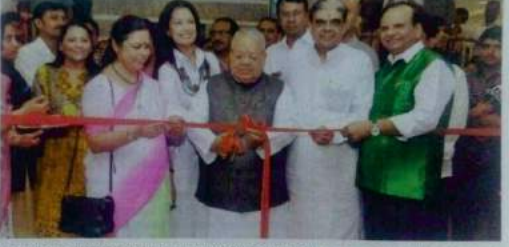
Union Minister of MSME Kalraj Mishra inaugurates Ritu Beri Khadi Collection by cutting the ribbon. Minister of State for MSME Haribhai Parthibhai Chaudhary and Chairman Vinai Kumar Saxena are also seen.

Khadi and Village Industries Commission (KVIC) on Sunday launched an exclusive collection of Men's and Women's wear designed by fashion icon Ritu Beri at its showroom Connaught Place here on Sunday. Union Minister of MSME Kalraj Mishra inaugurated the Exclusive Khadi Collection by lighting the traditional lamp and cutting the ribbon. Speaking on the occasion, Mishra said that Khadi sales growth has increased three folds and added that Prime Minister Narendra Modi is the Brand Ambassador of Khadi. Minister of State of MSME, Haribhai Parthibhai Chaudhary said Prime Minister promoted Khadi even on his every foreign tours. Speaking on this occasion Ritu Beri said that she started her profession 25 years back by designing Khadi cloths.