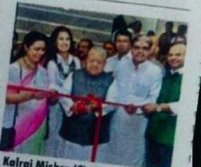
Kalraj Mishra (C), Meenakshi Lekhi (L) and KVIC officials during inauguration of Khadi collection

NEW DELHI: Khadi and Village Industries Commission (KVIC) launched exclusive Khadi collection of Men's and Women's wear on Sunday in its showroom designed by fashion icon Ritu Beri at Khadi India outlet at Regal Building Connaught Place in New Delhi. Kalraj Mishra, Minister, MSME inaugurated the collection by lighting the traditional lamp and cutting the ribbon. Speaking on the occasion Mishra said that Khadi is now for each and every one. He said Khadi sales growth has increased three folds and added that Prime Minister Narendra Modi is the Brand Ambassador of Khadi. Haribhai Parthibhai Chaudhary, Minister of State said Prime Minister always promotes Khadi even on his every foreign tours. Speaking on this occasion Ritu Beri said that she started her profession 25 years back by designing Khadi cloths.