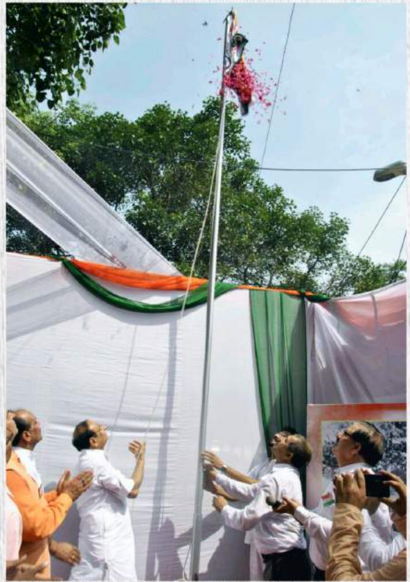
Flag Hoisting by Chairman, KVIC on Independence Day at Khadi India (Gramodyog Bhavan), New Delhi. He also inaugurated the Khadi Sale and planted a sapling in the premises of KVIC, New Delhi office.