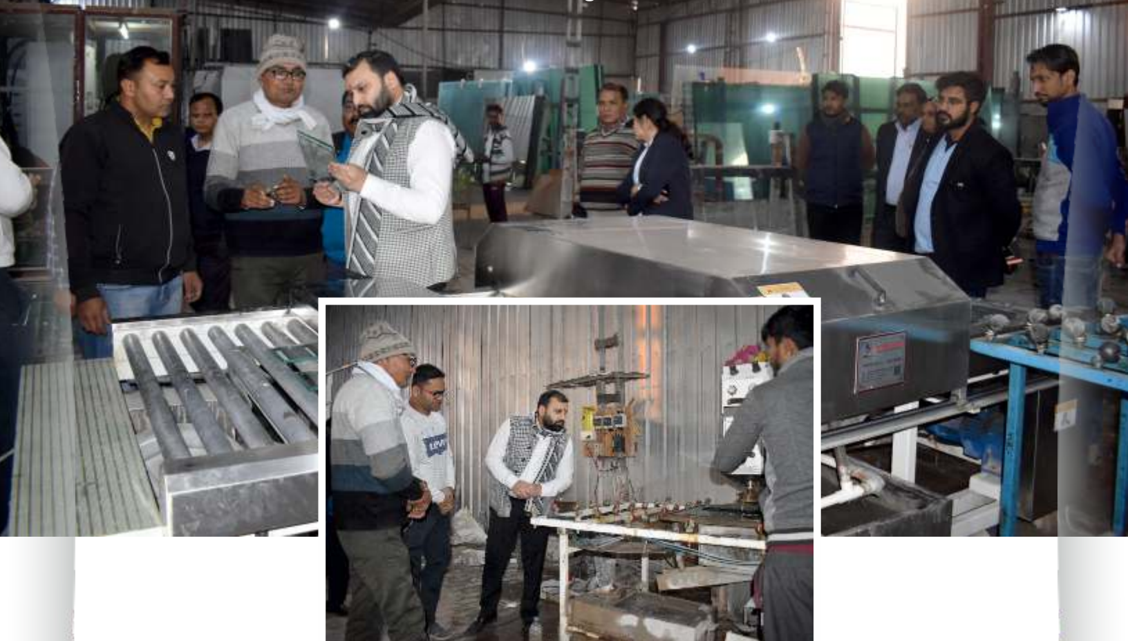
Chairman, KVIC met representatives of Odisha Khadi Institutions on 3rd, January, 2023.