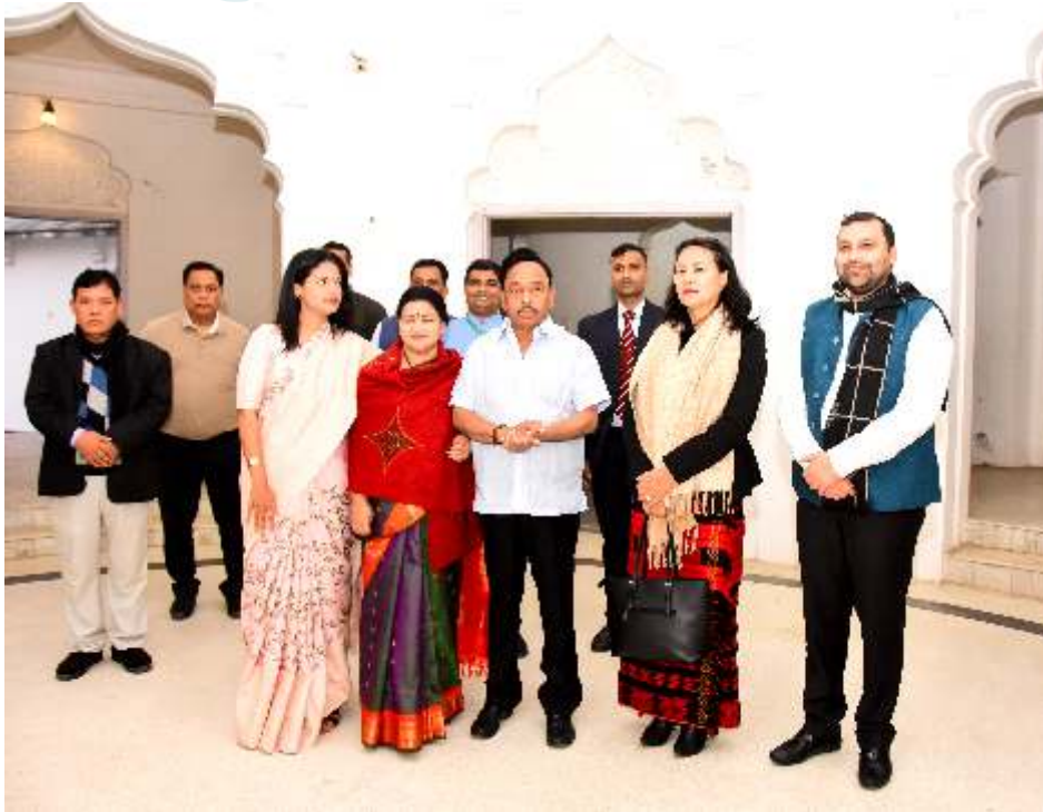
Chairman KVIC with MSME Minister visited Neermahal on 9th January, 2023 during his visit to inaugurate KVIC and TKVIB complex in Agartala