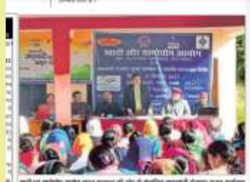
खादी एवं ग्रामोद्योग आयोग वाराणसी की ओर से तेलियाबाग में दिनांक 19 दिसंबर को आयोजित की गयी है। इसमें उत्तर प्रदेश के अलावा देश के विभिन्न राज्यों की संस्थाएं अपने उत्कृष्ट उत्पादों को प्रदर्शित की हैं। • विपन्न