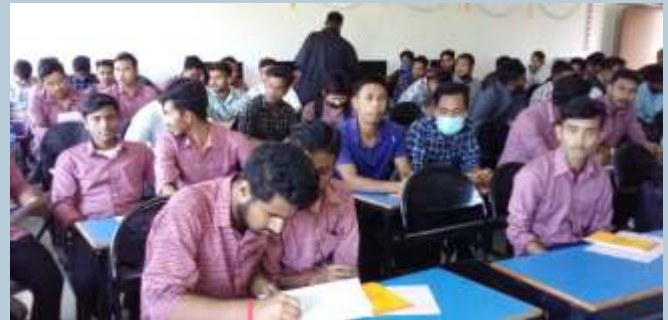
Awareness camp on PMEGP organised in ITI, Teliamura, Khowai distt, Tripura on 9.12.2.