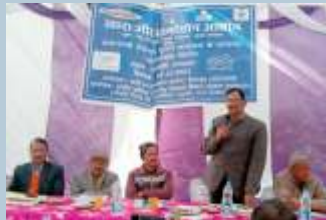
Awareness programme on PMEGP organised at Amodi District, Uttarakhand on 18th December, 2021.