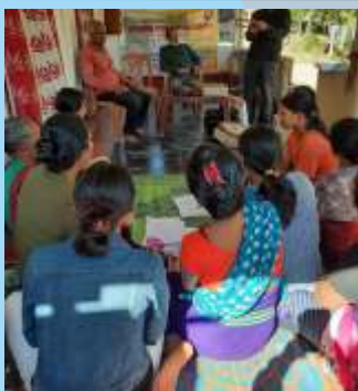
5 days Bee keeping training commenced from 17.12.21 at Chamonu, Distt Dhalai ( Aspirational distt), Tripura