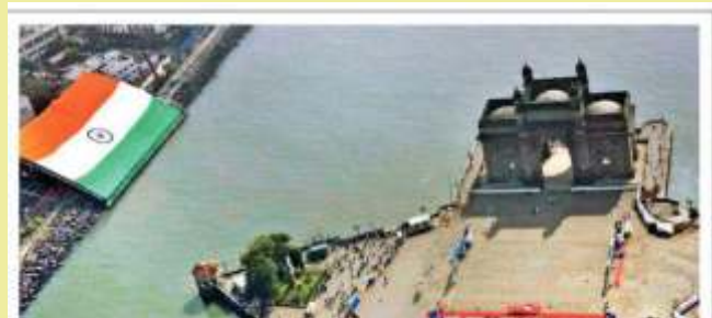
विशाल तिरंगा ध्वज... नौसेना दिवस के अवसर पर मुंबई में प्रदर्शित खादी स्मारकीय राष्ट्रीय ध्वज।

हा ध्वज नौसेना की संपूर्ण भावना और खादी की निरस्त कारीगर हस्तकला का प्रतीक है। खादी और ग्रामोद्योग आयोग (केबीआईसी) द्वारा स्वतंत्रता के 75 वर्ष 'आजादी का अमृत महोत्सव' मनाते