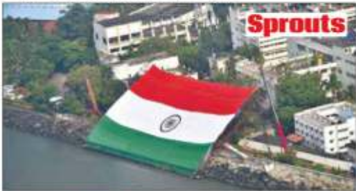
IVYOTI DUREY | SPROUTS

The Monumental National Flag, which is the world's largest national flag made of Khadi fabric, was put to a grand public display in Mumbai, as the Indian Navy celebrated 'Navy Day' on Saturday. The Navy displayed the flag at the Naval Dockyard adjacent to the iconic Gateway of India. The Monumental National Flag, which symbolizes the collective spirit of Indian-ness and the heritage artisanal craft of Khadi, has been conceptualized and prepared by Khadi and Village Industries Commission (KVIC) to celebrate 'Azadi Ka Amrit Mahotsav', the 75 years of Independence. KVIC has handed over the flag to the Defence forces for displaying the same at prominent places on historic occasions.