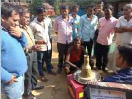
Trainees under pottery training producing products at their own on 19.12.21 at Taranagar, West Tripura distt, Tripura