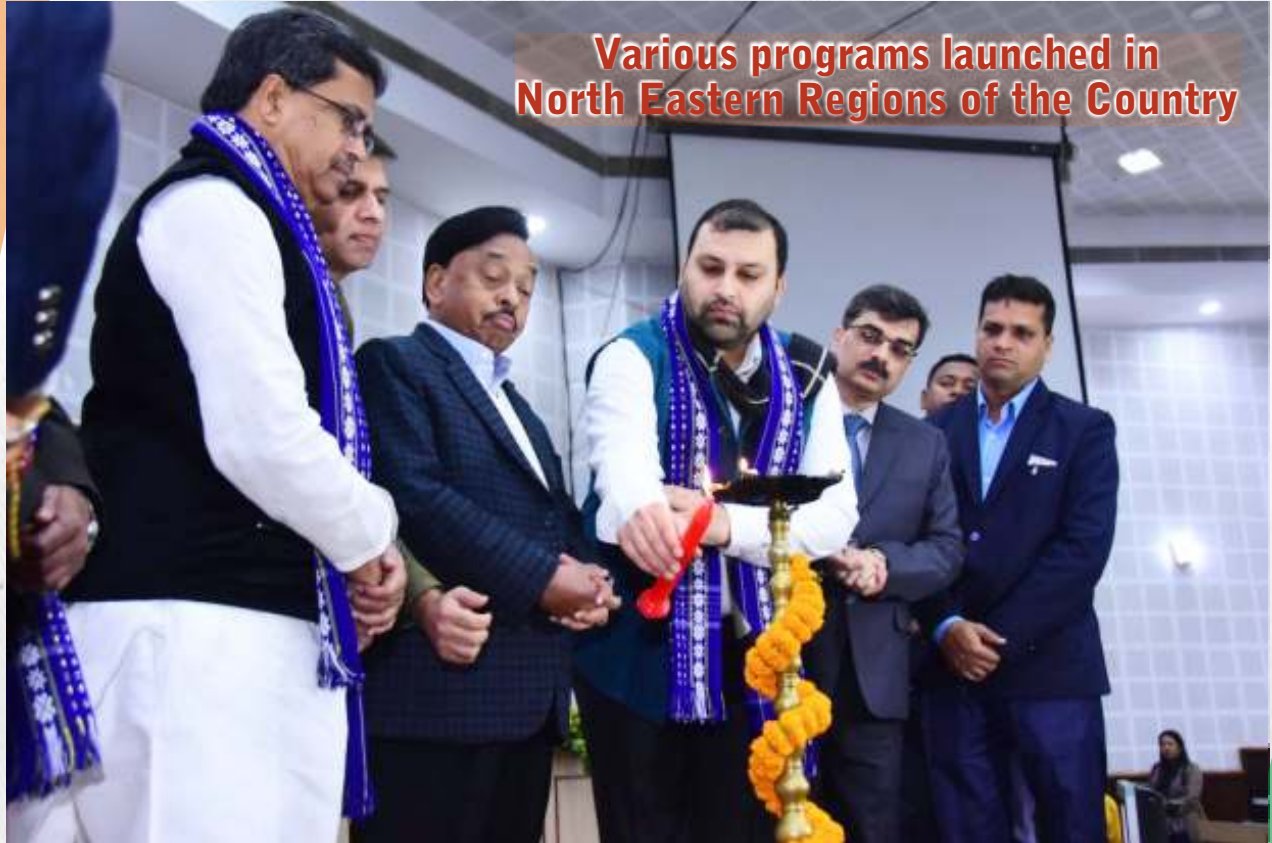
Various programs launched in North Eastern Regions of the Country

Chairman, KVIC meets Dr. Jitendra Singh, Minister of State for Personnel, Public Grievances and Pensions